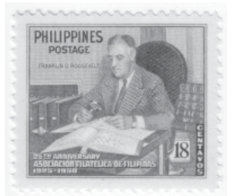
Figure 3. A number of countries have depicted Franklin Roosevelt working on his stamp collection, including this 1950 issue from the Philippines.