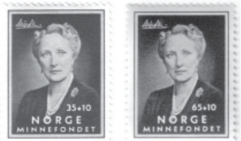
Figure 2. Crown Princess Martha died April 5, 1954, after a long illness at the age of 53. Two semipostals (a 35-øre+10-øre and a 65-øre+10-øre) were issued March 28, 1956 to raise funds for her memorial.

The famous stamp collector, of course, was the President of the United States, Franklin Delano Roosevelt, who lived mostly at the White House in Washington, DC but relaxed at his home in Hyde Park, NY, on the presidential yacht “Potomac,” and often at Martha’s house in Bethesda, MD. The President’s understanding wife was Eleanor, the world-renowned author, humanitarian, and diplomat.