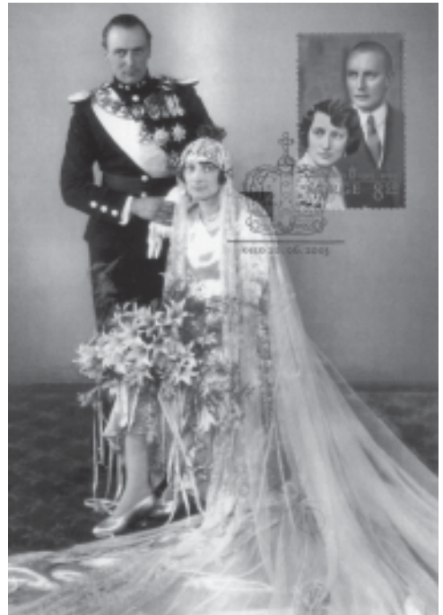
Figure 1. Olav, then Crown Prince, married Martha on March 21, 1929. The NOK 8.50 stamp on this maxi-card was among a set of three issued June 20, 2003 to commemorate the 100 th anniversary of Olav’s birth. He died January 17, 1991.

Whenever time permitted from his responsibilities he would sit for hours in the den of the big white house, and the princess’ children would join him for conversation and to help him sort through stacks of stamps, always fascinated by what they learned from the pictures on stamps. Later, after the princess moved into her own 24-room stone house a few miles away, she wrote a warm letter to the stamp collector,