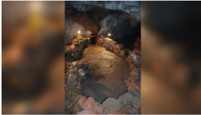
Archaeologists found that the Vikings constructed this boat-shaped structure out of rocks. Inside the structure, the Vikings burned animal bones at a high temperature.

Archaeologists have discovered the remains of rare artifacts from the Middle East in an Icelandic cave that the Vikings associated with Ragnarök ("Doom of the Gods"), an end-times event in which the gods would be killed and the world engulfed in flames. The cave is located by a volcano that erupted almost 1,100 years ago. At the time of that eruption, the Vikings had recently colonized Iceland. "The impacts of this eruption must have been unsettling, posing existential challenges for Iceland's newly arrived settlers," a team of researchers wrote in a paper published recently in the Journal of Archaeological Science . Archaeological work shows that after the lava cooled, the Vikings entered the cave and constructed a boat-shaped structure made out of rocks. Within this structure, the Vikings would have burned animal bones, including those of sheep, goat, cattle, horses and pigs, at high temperatures as a sacrifice. This may have been done in an effort to avert Ragnarök.