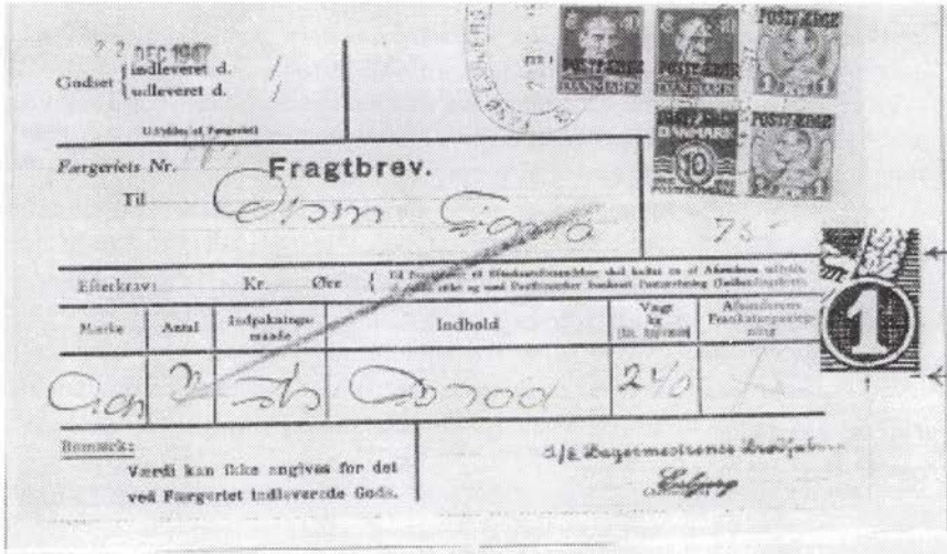
Figure 1 Denmark Ferry Post, Esbjerg – Fanø. Date 22.DEC.1947. Rate set at 24x12 - 2.88 raised to 2.90 Kroner per regulations. The lower stamp in the pair of PF20 is the double impression on position 79 right-hand side oval and numeral tablet.

At some point in my stamp collecting life I must have come to the realization that the constant reaching for the goal of having the most stamps was totally without meaning and I went in search of an area to specialize in.