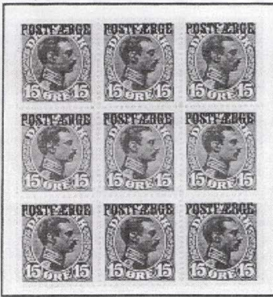
Figure 4 AFA pf2x Positions 43,44,45; 53,54,55; 63,64,65

all the stamps that bore the overprint could be found with the overprint used, not only during the period of D & T operation of the ferries, but long after as