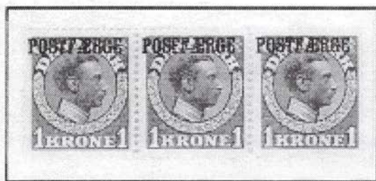
Figure 5 AFA pf4x