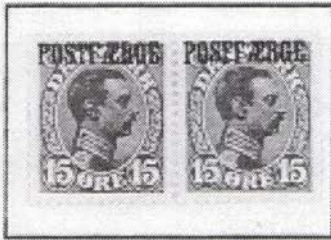
Figure 3 AFA Pf2x

all the stamps that bore the overprint could be found with the overprint used, not only during the period of D & T operation of the ferries, but long after as