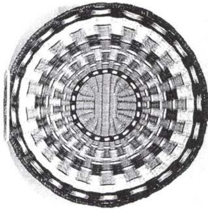
Hopi Indian wicker platter awarded for "Postal History of Official Mail Letters in Sweden 1632-1873"